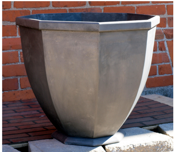
PLAIN OCTAGONAL URN